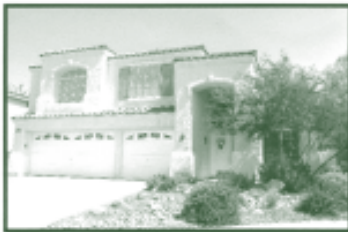
2007 Summerside Ct. 100% List Price